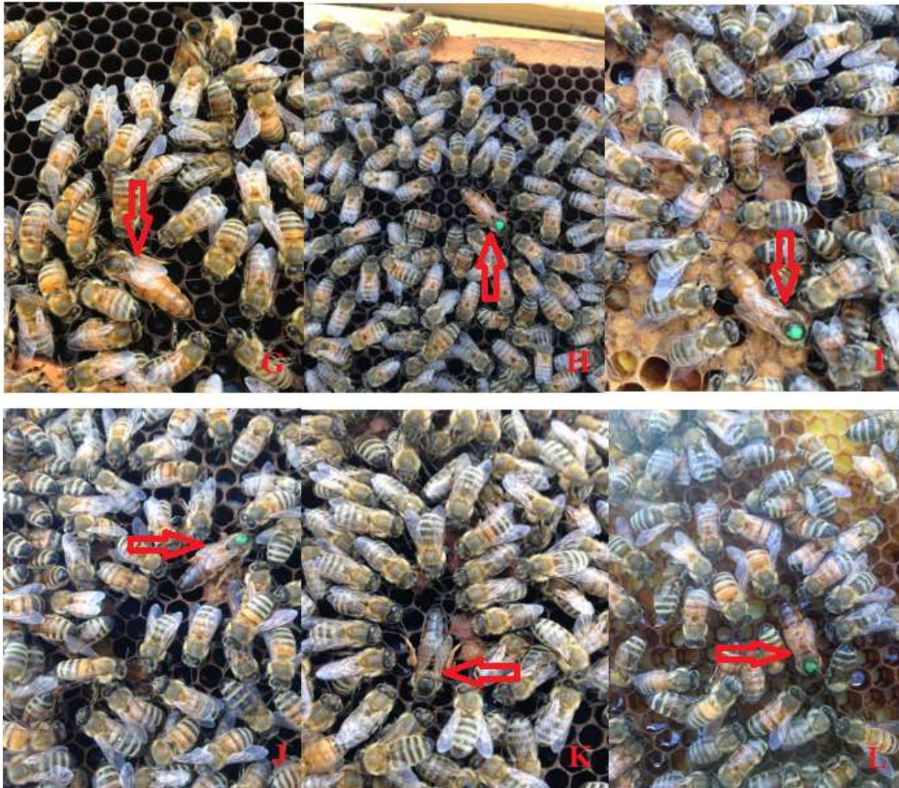
Figures 2 and 3 show photos of the selected breeder queens, their worker progeny, brood pattern and queen retinue.