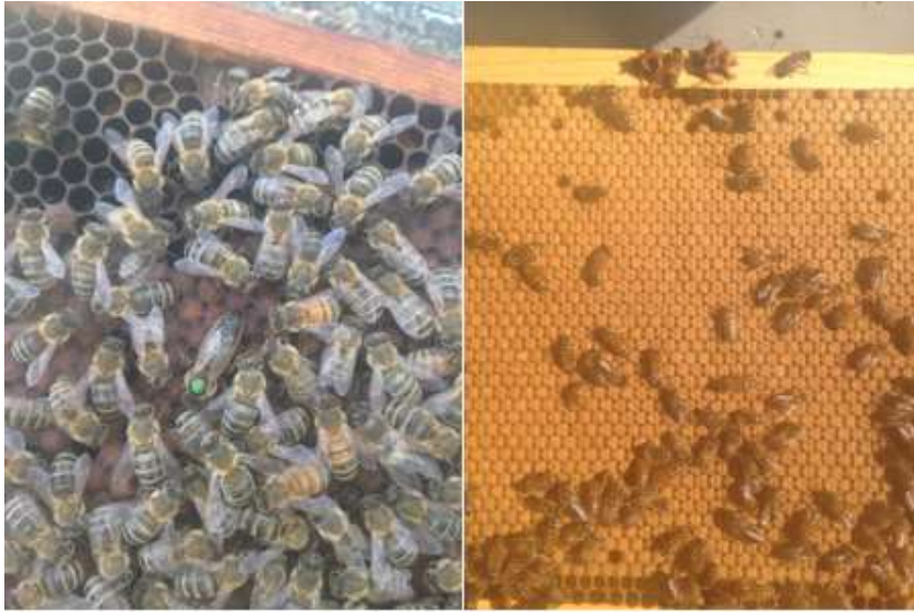
C) S96 PRD-14 (Hygienic Behavior; 89%U+74%R)