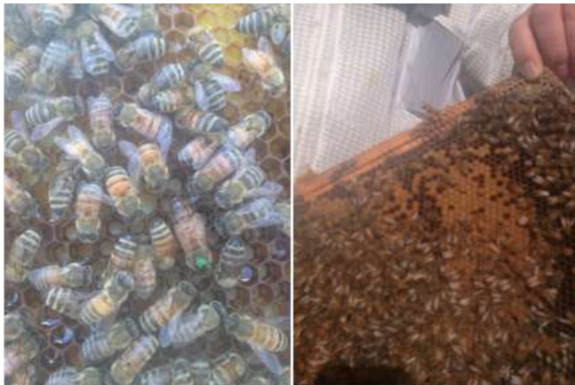
D) Y26x26 Martins (Hygienic Behavior; 100%U+100%R)